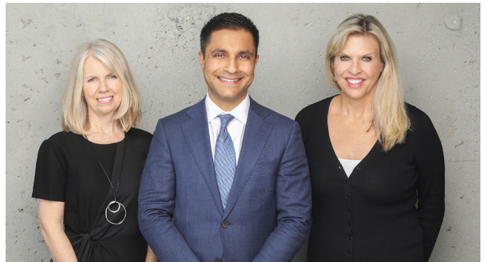
Gill Wealth Management Group TD Wealth Private Investment Advice